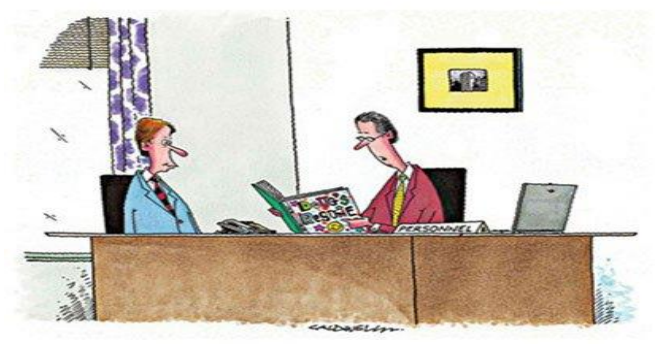
"Any other skills besides scrapbooking?"

<u>Disclaimer</u>: This newsletter is created for the interest of U3A Tawa members only. The writer and the executive make every effort to ensure that the information it contains is correct but take no responsibility for any inadvertent errors that might appear.